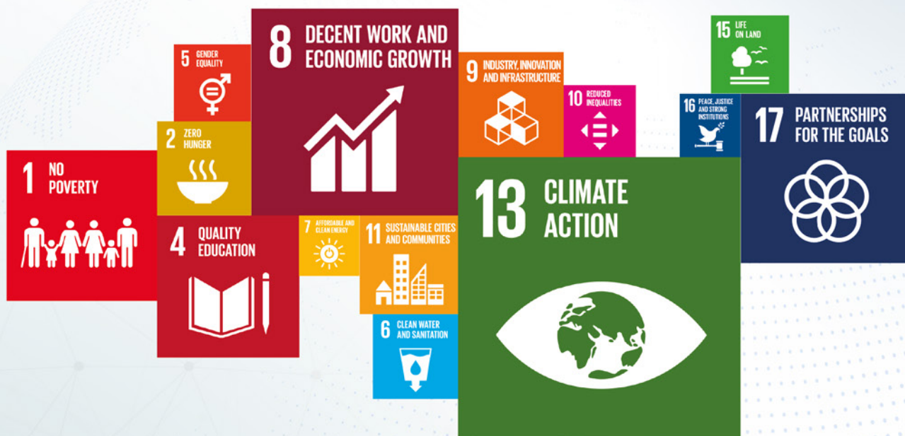
Diagram represents proportional presence of thematic areas in the portfolio.